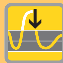
Electronic Analysis of Motor Torque