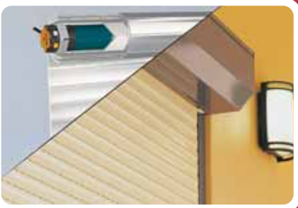
Cutaway image. Illustrative only.

Install automatic control to have your roller shutters open or close automatically, according to set times or weather patterns. Motorised roller shutters reduce heat loss from a bay window by 15 to 20% in winter and can shade your home from direct sunlight all year round.